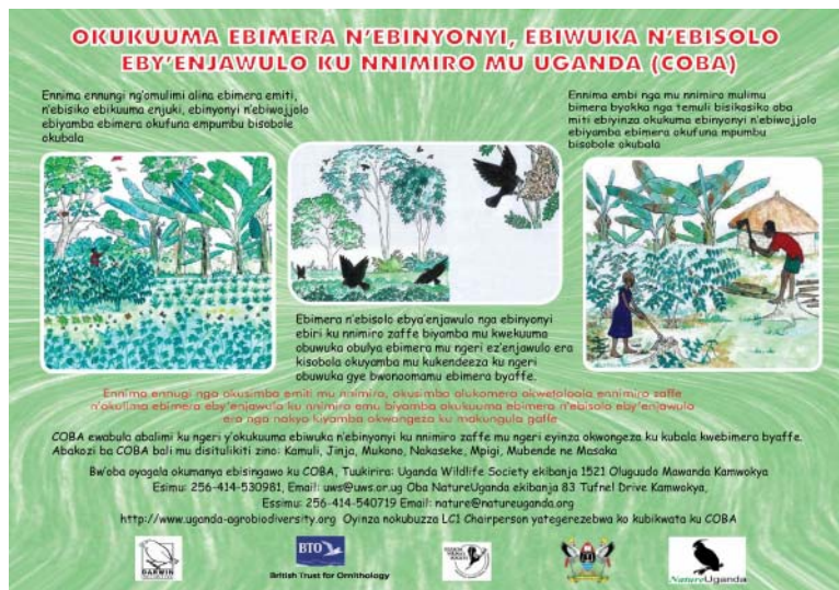
Figure 2. Copies of two of the posters produced to highlight agro-biodiversity issues: in this case the value of agroforestry and the importance of biodiversity in pest management.